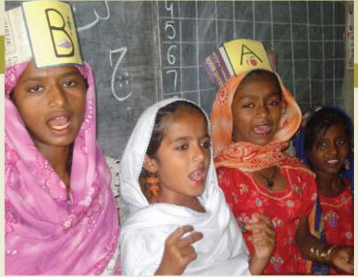
Children from the Rehmatulah Khaskele School

that was destroyed during the severe floods of 2006. The families were provided with emergency and rehabilitation grants through Tearfund UK and were given further support to rebuild the school through my home Link church, St Andrew's Chorleywood. It has a much stronger structure with space around it for children to participate in sports. Fifty